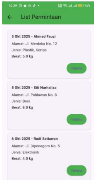
Fig 1. Request list and collection history

The implementation of waste collection through the mobile system is realized via two primary features: Request List and Collection History (Fig 1). Within the Request List menu, households submit and monitor their pickup requests, specifying waste category, weight, and address, while collectors accept and process these requests in real time. Completed activities automatically appear in the Collection History interface, which records the date, waste type, verified weight, points earned, and status completion.