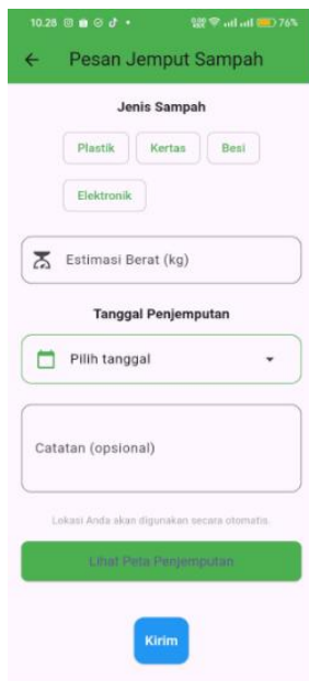
Fig 3. Pickup Request Form

equivalent to Rp 3,600 under the Rp 50 per-point conversion.